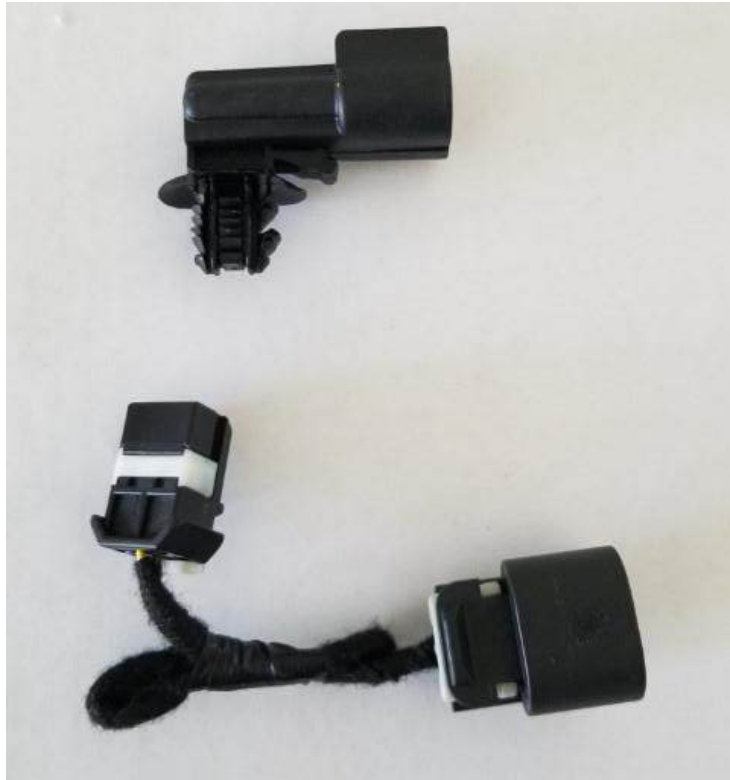
Terminator and cable removed.

The right hand connector is actually a terminator that tells the CAN C buss that it doesn't have an open circuit. You need to pull this part out of the mounting hole. It will not be used.